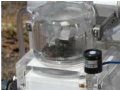
Fig. 1 Cuvette measuring chamber for CO 2 exchange of cyanobacterial crusts that remains open 90% of the time exposing the crust to natural environmental conditions.

Initial biodiversity assessments have revealed complex crust communities that can be divided into three main types: (a) flood plain crusts co-dominated by Scytonema and Nostoc with abundant liverworts ( Riccia spp.), (b) dry savannah and elevated crusts dominated by Scytonema , Stigonema with lichens (mostly Peltula patellata and Diplochistes ) and liverworts, (c) rock crusts dominated by cyanobacteria and cyanolichens ( Peltula spp.). Primarily, CO 2 exchange is measured with an automated cuvette system (Walz, Germany, Fig. 1). This records the CO 2 difference (three times at 20 sec intervals) over three minutes on a thirty-minute cycle (24 hours).