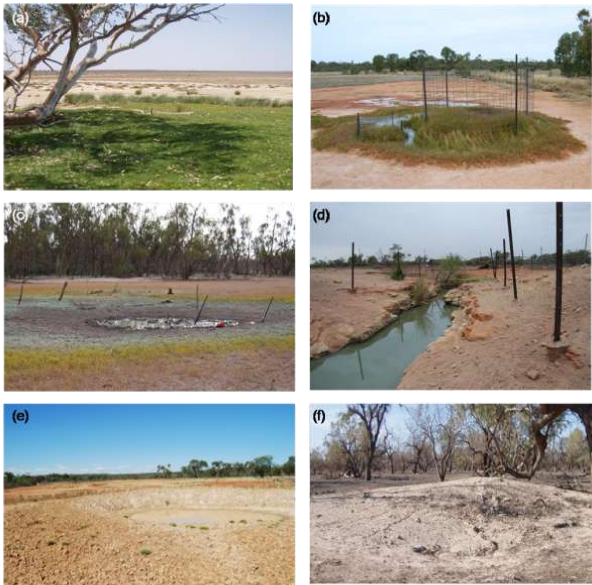
Fig. 2. Examples of the artesian spring states included in our model from western NSW and south-western Qld: (a) Late succession 'old' Peery Springs vent with spring endemic Salt Pipewort Eriocaulon carsonii (state 1b; photo by H.A.R. Caddy); (b) Towry Springs, Culgoa Floodplain National Park Qld, no endemic or relic species present (state includes, 'pooling vent' or 'carpet' type springs) (state 3; photo by H.A.R. Caddy); (c) Mother Nosey Spring, NSW, highly degraded springs no vegetation on spring vent ('mud' springs type) (state 4; photo by H.A.R. Caddy); (d) Excavated spring state, Old Gerera Spring Ledknapper Nature Reserve NSW (state 4, photo by H.A.R. Caddy) (e) Collapsed inactive or extinct 'crater' type springs are common in western NSW and south-western Qld (state 5; photo by H.A.R. Caddy); (f) Inactive or extinct 'dry mound' type spring at Tharnowanni Spring-group, NSW (state 5; photo by H.A.R. Caddy).