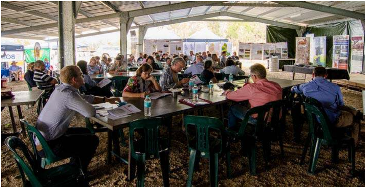
Fig. 3 Planning session, Mt Surprise 2016