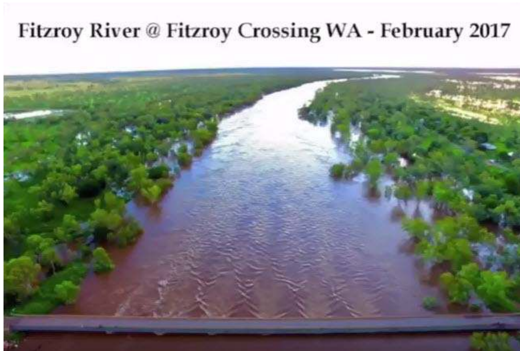
Fig. 1. Fitzroy River in flood

Look at all that water running straight out to sea (Fig. 1). Six thousand gigalitres going to waste every year. What a missed opportunity. It smacks of a kind of backwardness. Recall that previous generations used the term terra nullius to describe lands where the local inhabitants failed to put their natural resources to good use.